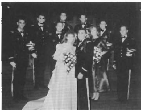
1987: Holland wedding party