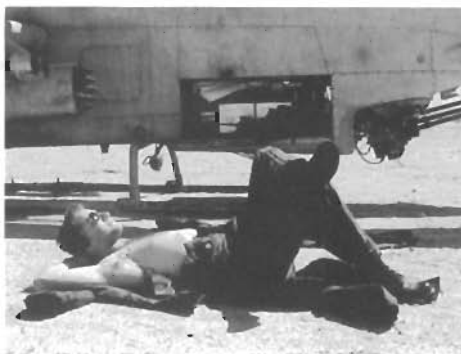
1988: "And when I'm not reading. . ."