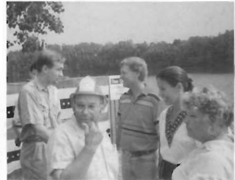
1989: The Voice with the former VP