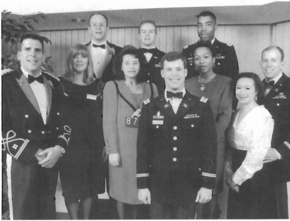
1987: Ft Bliss FD 93