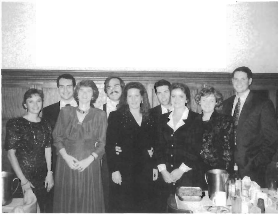
1988: Go Gators