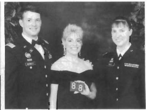
1988: Ft Bliss FD