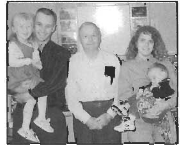
▲ 1988—The world's smallest FD celebration.