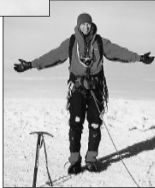
▼ 1988—The summit.