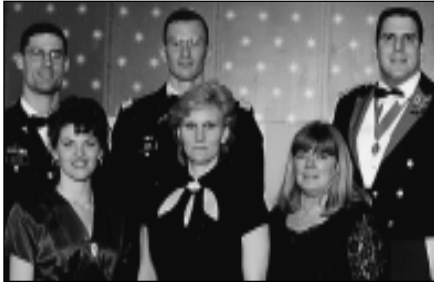
1987—A late 1998 Founders Day photo from CGSC.