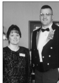
1988—Founders Day at Ft. Lewis.