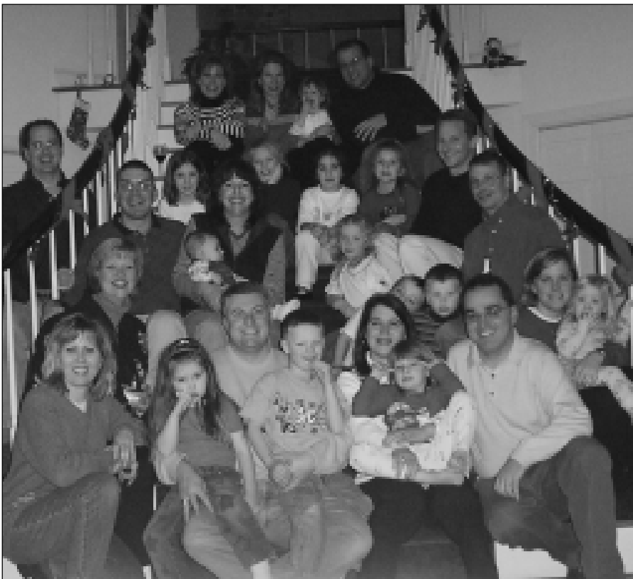
1988—Greek reunion 2002.