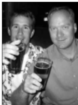
1987—The brew boys at the Flying Saucer.